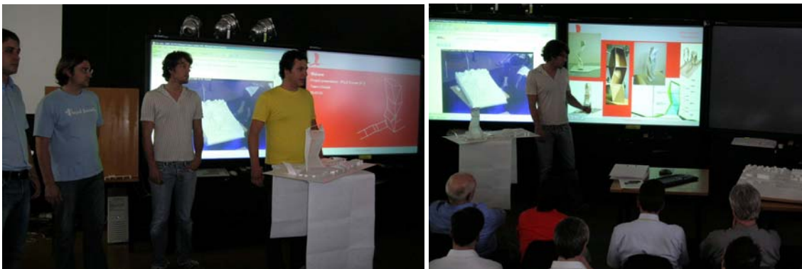
Figure 1: Use of the iRoom in the Project Oriented Learning Environment during the final presentations

In AEC industries experts often draw sketches if they have to explain issues or if they negotiate in meetings. The paradigm of a blackboard in combination with a touch sensitive computer screens was the idea of a Smartboard. Thus, to any kind of computer generated multi-media content user can add his or her comments, remarks and ideas simply through writing and sketching with electronic ink on the board on a transparent layer on top of the displayed information. This black board interface is especially intuitive for architects and engineers who are used to communicate with the means of drawings and therefore reduces the threshold to man computer interaction. Often ideas get shaped or become existent in the course of the drawing process. The concept of the iRoom is to let users assemble, move and interact with any kind of multi-media information e.g. several drawings and documents which are relevant for a decision topic on large display panels which are positioned close together. In an iRoom meeting, people with different professional backgrounds and even laymen can participate.