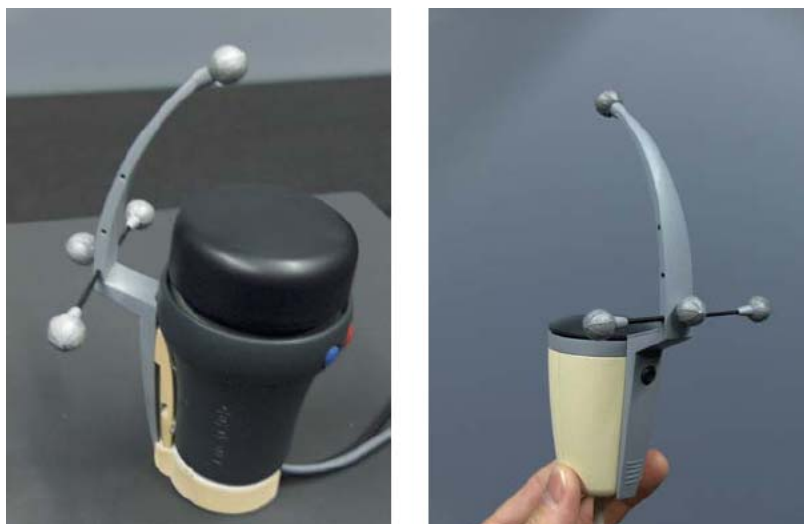
Figure 3: 3D Input devices

We actually develop to types of input device concepts. The first one provides a completely new developed device with a simple interaction concept. This keeps 3D interaction intuitive and easy for the user; although he has to interact with a device he is not familiar with (Simon and Doulis 2004). The second concept uses optical targets fixed to existing devices like PDA's or cell phones that are now used as interaction devices for the 3D User Interface (Watsen, Darken and Capps 1999 and Wagner, 2004). The user interacts with devices, he has become familiar with via an interface concept. In a next step we evaluate both concepts for the use in iRoundTable .